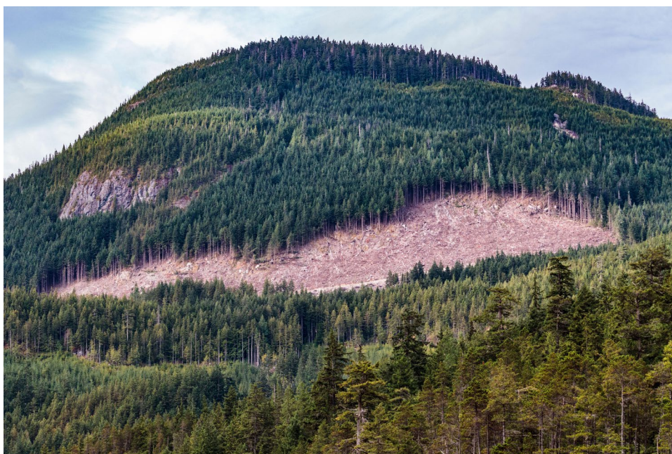
A patch of forest on a mountainside in coastal British Columbia has been clearcut, with a logging road just visible at the base of the logged area. Location: Hardwicke Island, August 2021.

Today the most perilous environmental concern is global climate change, which has also resulted from emissions from a multitude of local sources. While responses to this problem are still far from adequate, the planetary scale of the challenge and the need for similarly inclusive action is well recognized in most quarters. 60