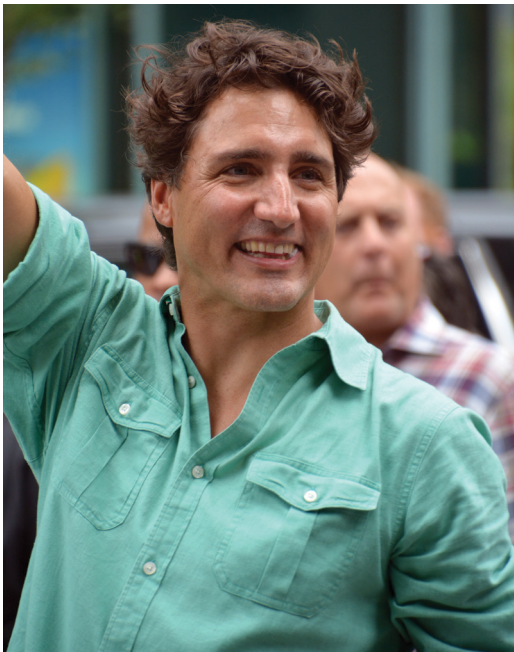
His charisma and ability to connect directly with voters helped Justin Trudeau return the federal Liberal Party to power in the 2015 election.

the social system that decides who has power and how it is to be used in governing the society’s affairs