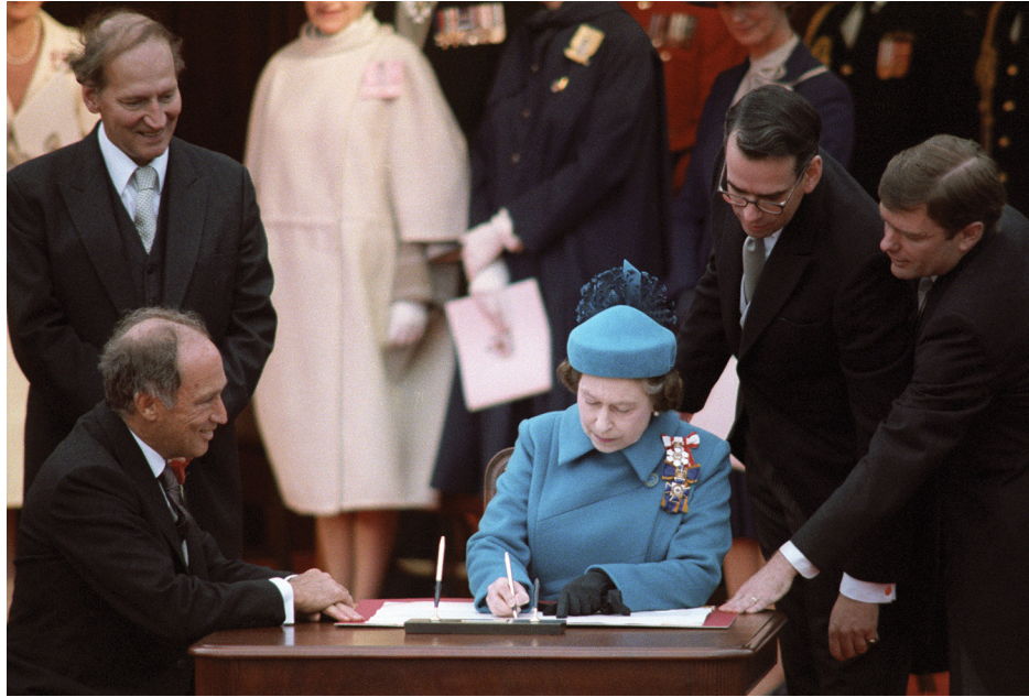
Prime Minister Pierre Trudeau and Queen Elizabeth are shown at the signing of Canada's Constitution Act, 1982 .

The Charter expresses and entrenches basic civil liberties, which are highly valued in a free and democratic country. These rights and freedoms include: